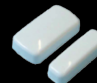
Wireless Magnetic Reed Switch